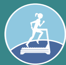
MODERN LIFESTYLE & RECREATION FACILITIES