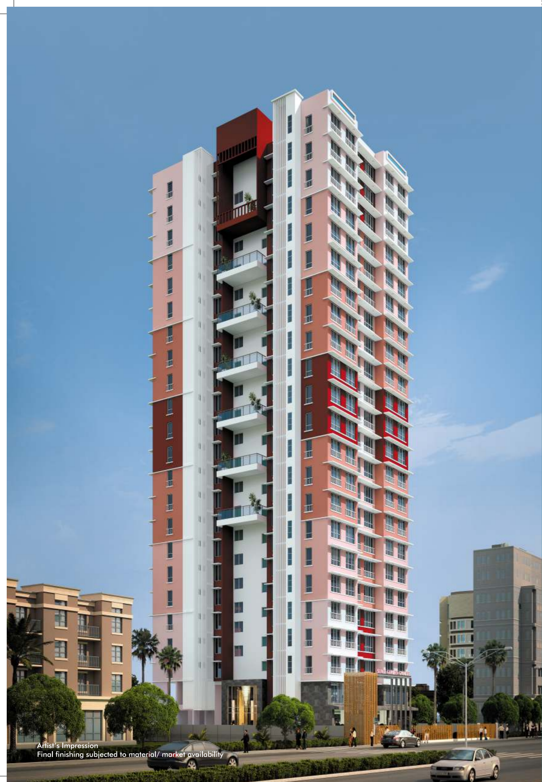
Artist's Impression Final finishing subjected to material/ market availability