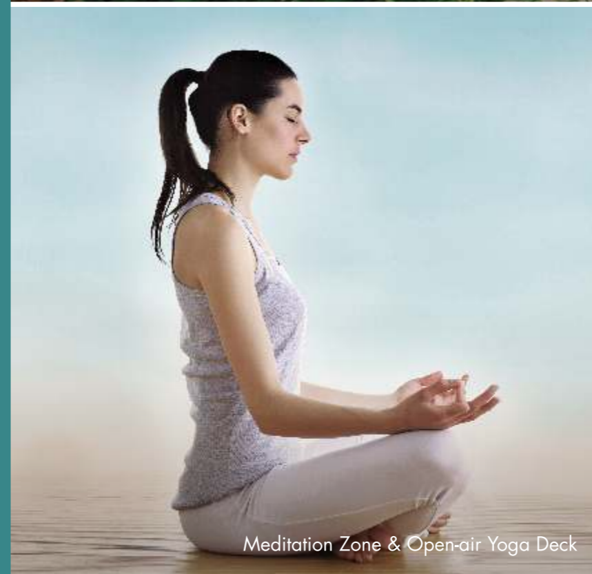
Meditation Zone & Open-air Yoga Deck